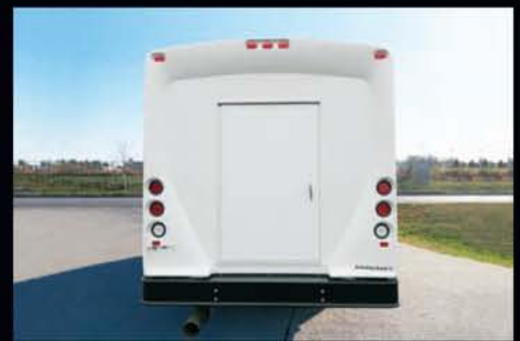
Stylish fiberglass rear cap with rear luggage access door