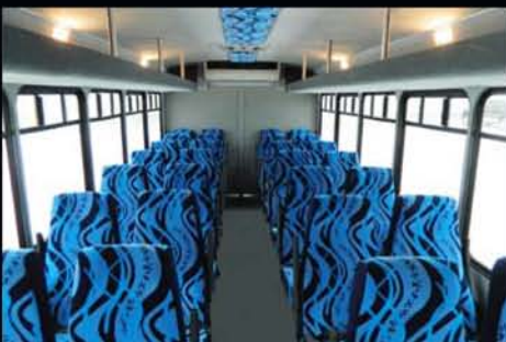
Spacious interior with high-back seats and overhead luggage racks