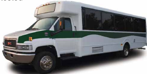
Several lengths of General Motors chassis also available.